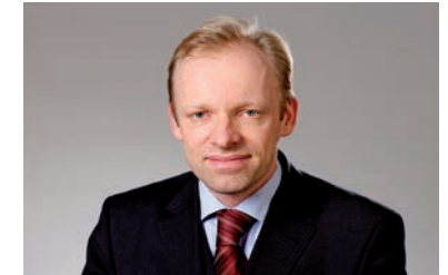
Prof. Dr. Clemens Fuest

Spokesman of the Kronberger Kreis, Director of the Walter Eucken Institute Freiburg, Member of the German Council of Economic Experts and Professor of Economic Policy, Albert-Ludwigs-University of Freiburg.